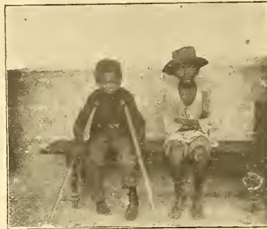
POCO TEMPO ?